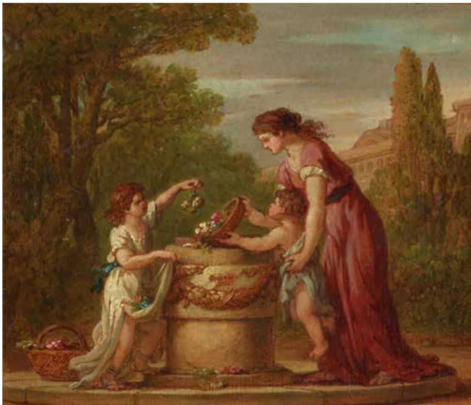
Joseph-Marie Vien (French, 1716–1809), Le Sacrifice à Minerve (The Sacrifice to Minerva) , 1788, oil on paper, 6 \frac{5}{16} × 7 \frac{1}{2} in. (16 × 19 cm), Museum purchase with funds provided by the Beaux Arts Krewé, 2019.16

Jan Pietersz Saenredam (Dutch, 1565–1607), After Hendrick Goltzius (Dutch, 1558–1617), Perseus and Andromeda , 1601, engraving, sheet: 10 \frac{1}{8} × 7 \frac{1}{8} in. (25.7 × 18.1 cm), image: 9 \frac{7}{16} × 6 \frac{15}{16} in. (24 × 17.6 cm), Museum purchase in loving memory of Jeannine O'Grody with funds provided by her family and friends, 2019.6